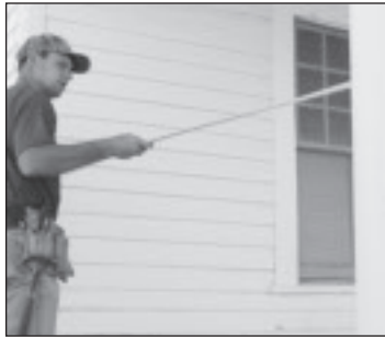
3. Measure opening where PermaPorch Railing is to be installed. If using PermaCast columns, take measurement from top rail and bottom rail.