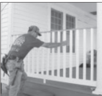
11. If using Savannah top rail, slide over top insert. Place rail section into position and attach with installation brackets. Follow instructions included with fasteners.