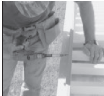
7. Place baluster at center point and screw through bottom PVC rail into baluster. Continue attaching baluster to bottom PVC rail.