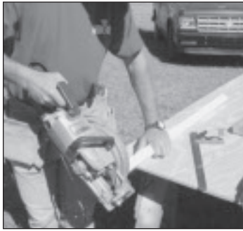
2. Trim balusters to adjust top rail height as needed. See note 2.

1. PermaPorch® Railing can be purchased in kits, by individual piece (carton quantity only) or preassembled. Each installation must have: top rail, top rail insert, balusters, bottom rail, bottom rail insert, fastening kit and support block. See Note #2 below for suggested top rail heights.