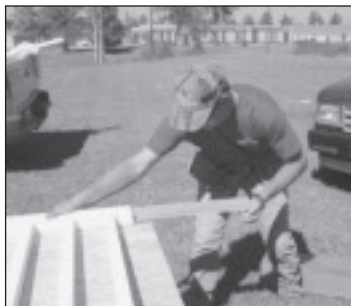
9. Apply non-acetone based construction adhesive to bottom of insert and place into bottom PVC railing.