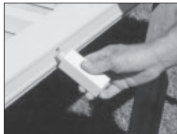
10. If length of rail section is over 4', you will need to install support block. Mark center point of rail section under bottom rail and drill 3/4" hole. Apply non-acetone based construction adhesive on end and insert into hole.