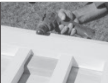
8. Decide the desired width between balusters (check local building codes, maximum 4" is standard). Attach balusters using #8, 2-1/2 galvanized deck screws, to top insert starting with center baluster. See Note #3 and #4.