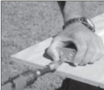
5. Prime sides and ends of wood inserts with exterior wood primer. Attach top and bottom rail fasteners (with included screws) according to instructions included with fasteners.