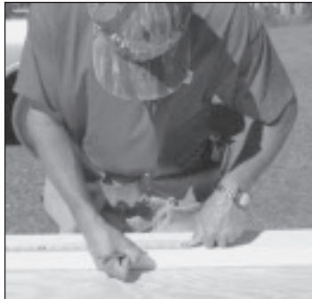
6. Measure the center point of top insert and bottom PVC rail and mark.