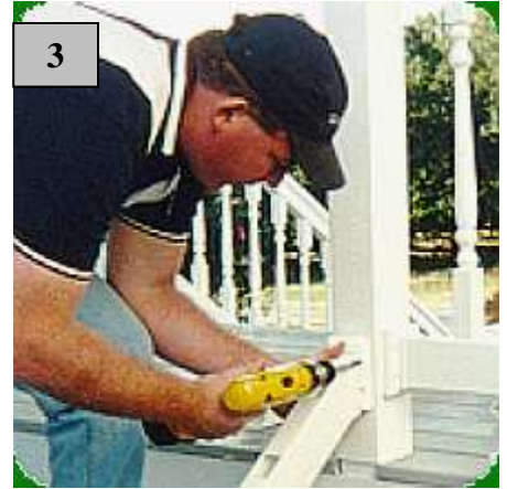
3 Place bottom rail into opening and secure bracket with four screws.