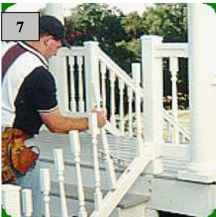
7 Insert remaining balusters into routed holes.