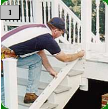
1 Rest bottom rail on stair treads and mark angle on each end of bottom rail. Make sure you have the same distance to the first hole on each end to assure a uniform appearance.

Before you begin installation , please check with your local building code official for required rail height in your area. To get started, unpack contents of box and locate top and bottom rail, balusters, brackets, and a pack of screws for the "T" Rail.