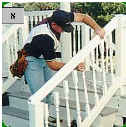
8 Holding top rail at an angle, connect top rail to balusters one baluster at a time.