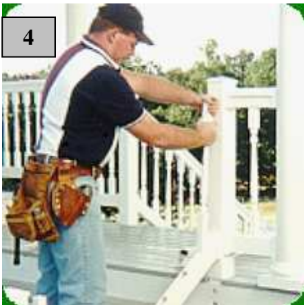
4 Insert a baluster into the first and last routed hole in bottom rail.