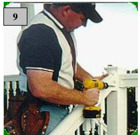
9 Level vertically and secure top rail with screws. Place two leveling screws through top and bottom brackets. Conceal screws with bracket cover.