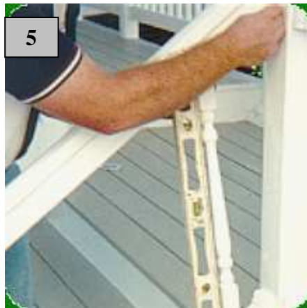
5 Connect top rail to balusters making sure you use same holes as bottom rail. Level balusters and mark angle on each end of top rail.