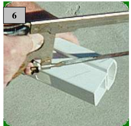
6 Trim off each end of previously marked angles. Place one mounting bracket on each end of top rail.