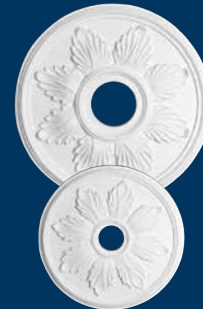
LADY SARA NO. 79461, D 23 3/8" NO. 79460, D 18"