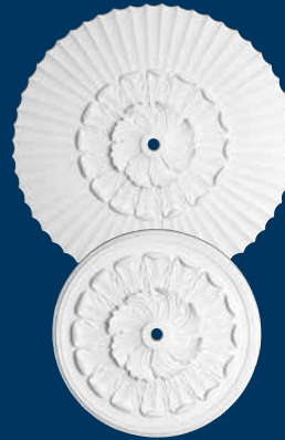
VENETIAN NO. 79300, D 31" NO. 79310, D 21 1/4"