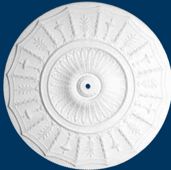
CABOT NO. 79450, D 44 3/4"