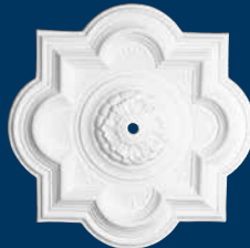
FLORENTINE NO. 79465, D 28 1/2"