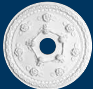
CHERUB NO. 79469, D 22 3/16"