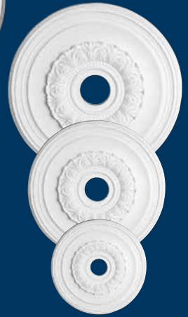
ANSLEY NO. 79483, D 29 1/2" NO. 79482, D 23 3/8" NO. 79481, D 16"