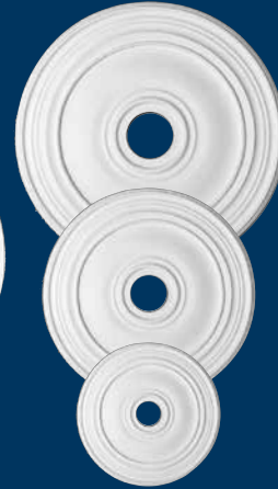
BRISTOL NO. 79472, D 29 3/4" NO. 79471, D 23 3/8" NO. 79470, D 16 1/8"