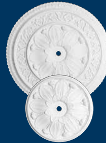
BILTMORE NO. 79479, D 25 3/4" NO. 79480, D 16 1/16"