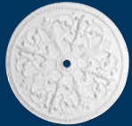
ASHTON NO. 79170, D 17 1/2"

the look and feel your room needs. These historically accurate accents are lightweight, durable, easy to install, and low maintenance.