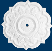
QUEEN ANNE NO. 79477, D 21"