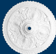
CHARLOTTE NO. 79478, D 24"