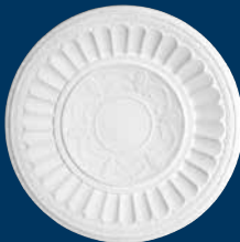
STRASBOURG NO. 79475, D 27" (2 3/8" Recessed Depth)