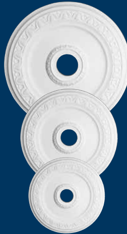
EGG AND DART NO. 79487, D 30 5/8" NO. 79486, D 24" NO. 79485, D 18 1/2"