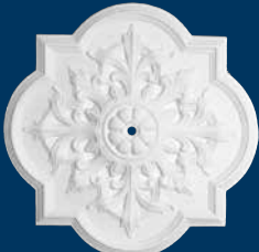
NORWICH NO. 79455, D 31 3/8"