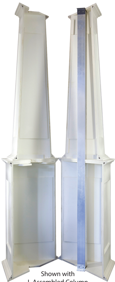
Shown with L-Assembled Column

RigidWrap™ is a fully assembled cPVC column with an internal aluminum post. The aluminum post makes a RigidWrap™ column load bearing. Brackets and hardware are included with the product. The brackets attach the aluminum post to the floor and beam/header. This secure connection delivers wind uplift resistance. The aluminum post and bracket may also be purchased separately for use with PermaWrap® L-Assembly columns or PermaSnap™ Column Wraps.